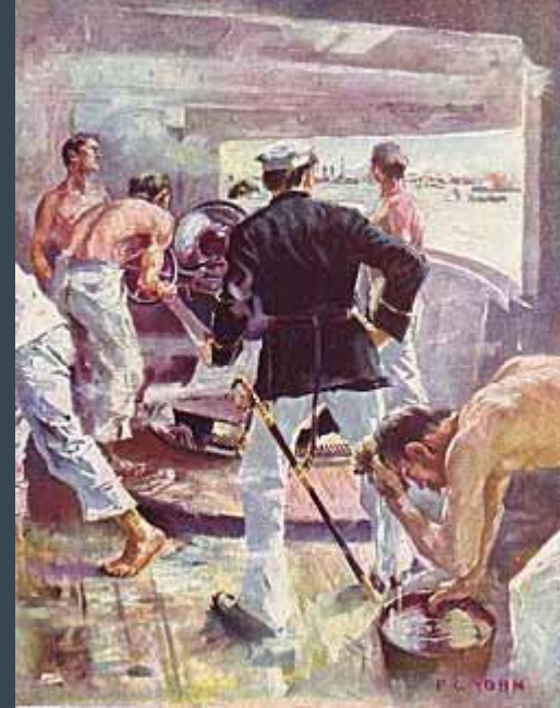
Americans aboard the Olympia prepare to fire on Spanish ships during the Battle of Manila Bay, May 1, 1898.

The United States was simply unprepared for war. What Americans had in enthusiastic spirit, they lacked in military strength. The navy, although improved, was simply a shadow of what it would become by World War I. The UNITED STATES ARMY was understaffed, under equipped, and undertrained. The most recent action seen by the army was fighting the Native Americans on the frontier. Cuba required summer uniforms; the US troops arrived with heavy woolen coats and pants. The food budget paid for substandard provisions for the soldiers. What made these daunting problems more manageable was one simple reality. Spain was even less ready for war than the United States.